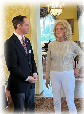
The First Lady