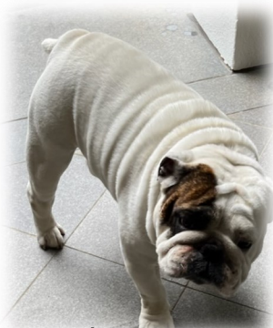
The First Dog