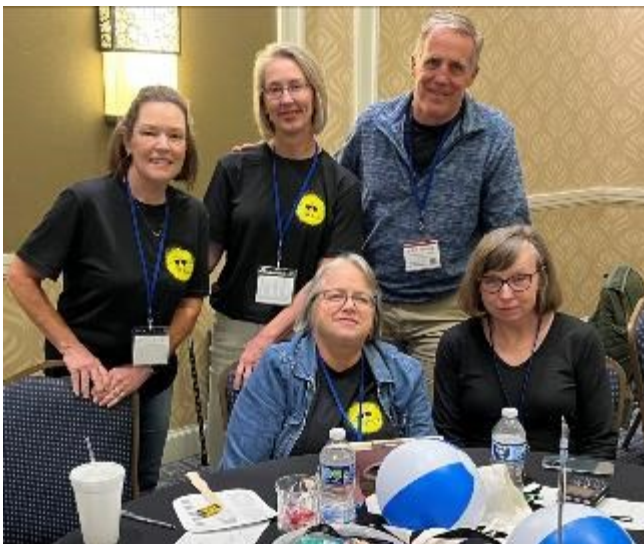
St. Andrew's Synod Assembly Delegates

CONGRATULATIONS! The following people were elected to serve: