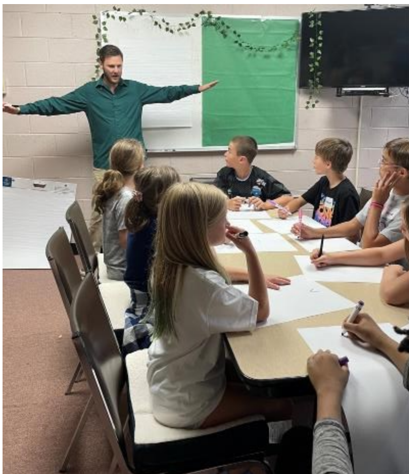
STORY TIME IS ALWAYS AN ADVENTURE!