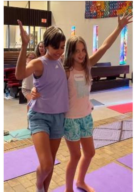
VBS Opening begins with a little yoga and meditation. Nothing like watching friends helping friends.

Help God mend the earth by enriching the soil that grows our food.