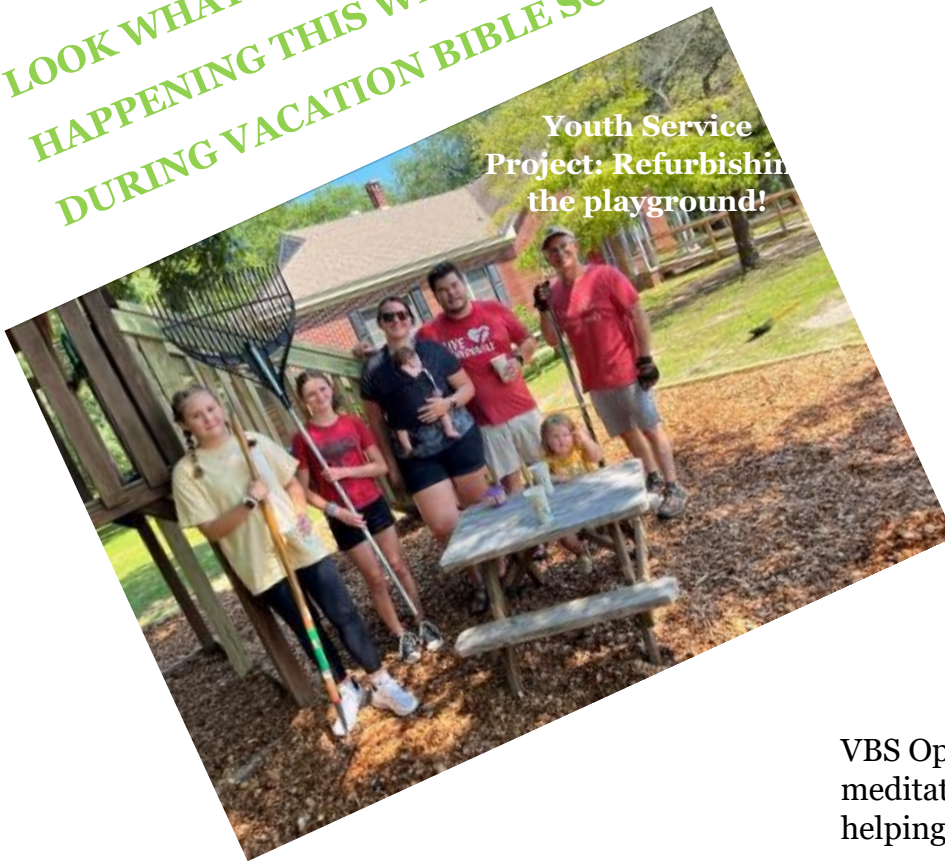
Youth Service Project: Refurbishing the playground!

LOOK WHAT'S HAPPENING THIS WEEK DURING VACATION BIBLE SCHOOL!