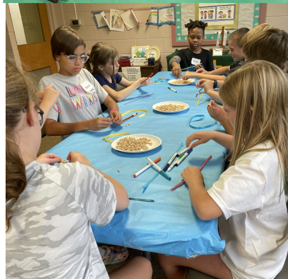
ARTS AND CRAFTS!