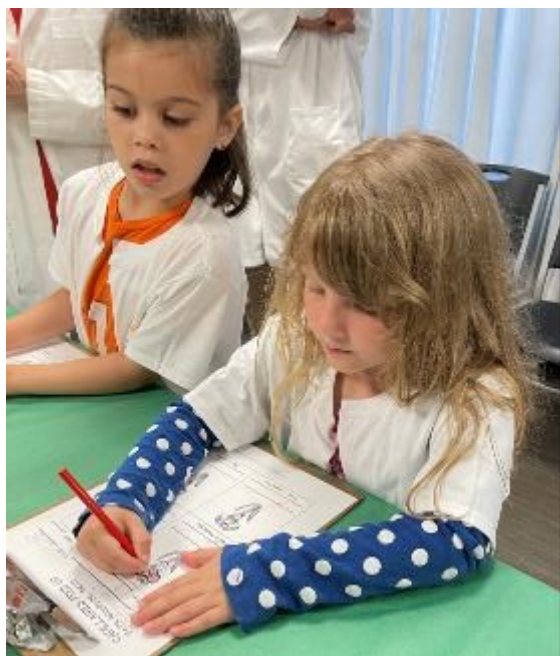
FUTURE SCIENTIST AT WORK!