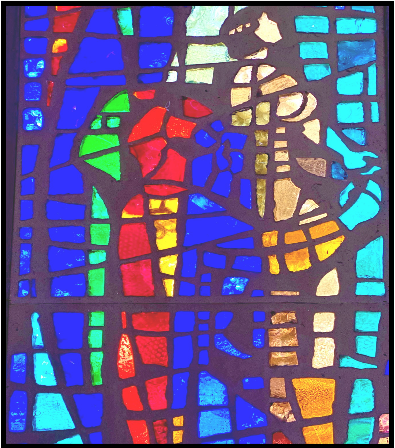
Stained glass—St. Andrew's Lutheran Sanctuary— We will be looking through this together soon!