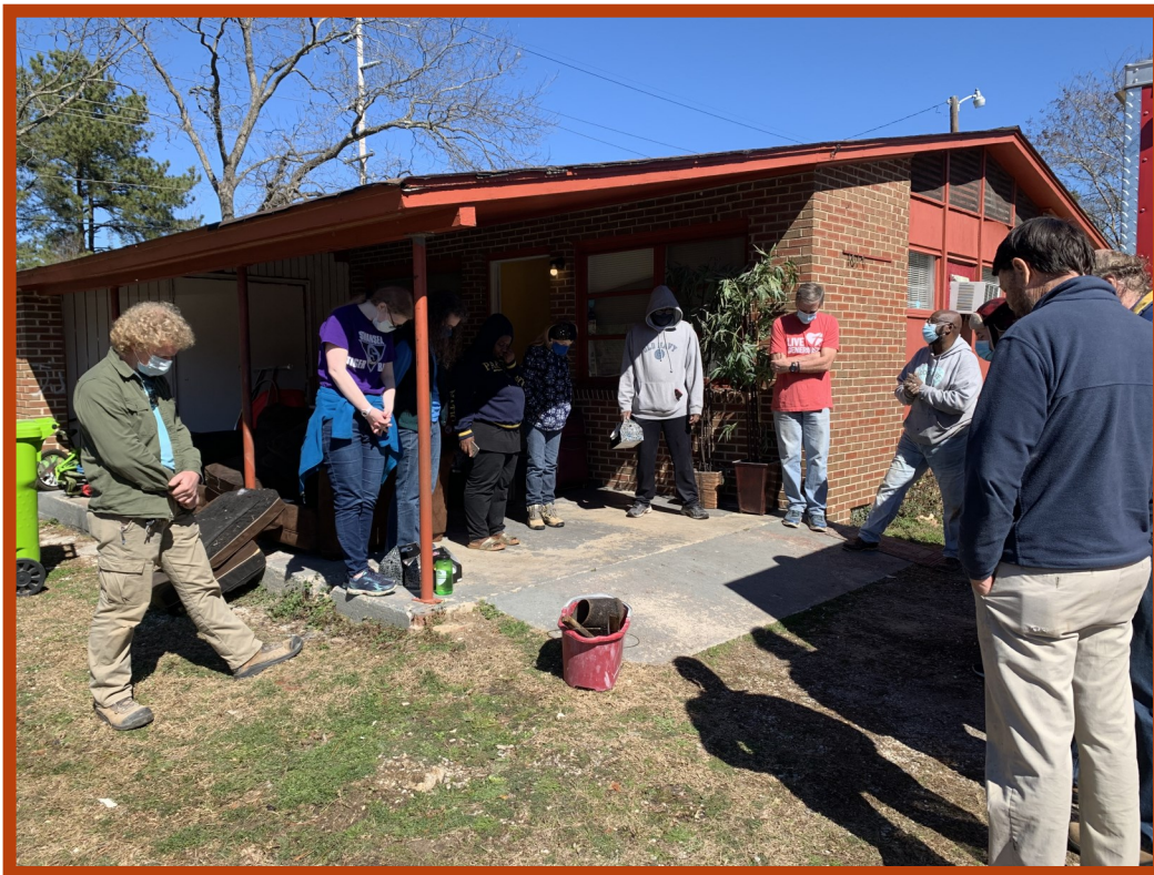
Volunteers take a moment for prayer.