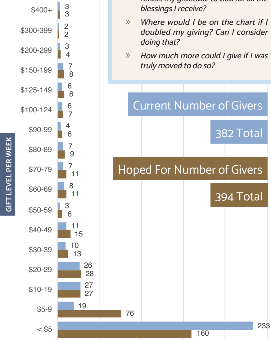
RANGE OF GIFTS GIVEN AND HOPED FOR

This chart points out where we are now. Look over the chart and ask yourself these questions: