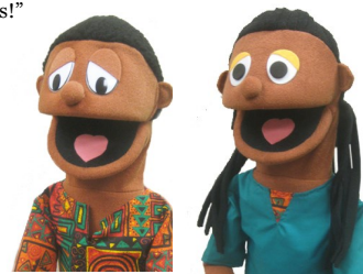
"We can't wait to meet the children of St. Andrew's!"