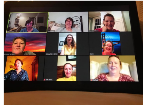
Book Club Zoom