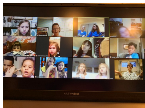
Pajama Party Zoom