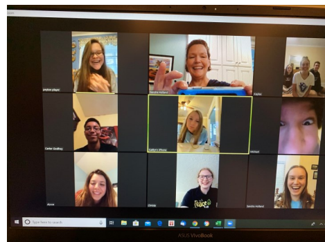
Youth Group Zoom