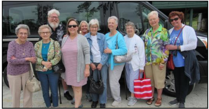
Young at Heart apple picking trip.