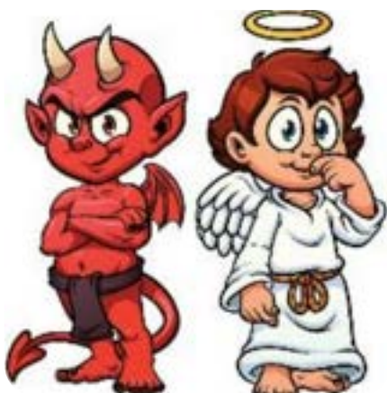
table talks with PT